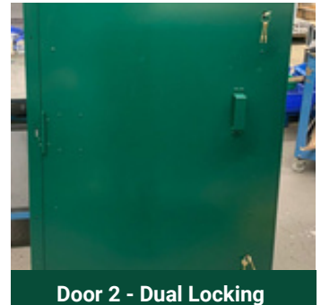
The Door 2 model enhances security with a dual-lock system, offering a strong barrier against intruders. This mid-entry option is favoured for its balance of strength, easy installation, reusability, and affordability. It embodies the perfect mix of security and practicality, ensuring uncompromised protection for your property.