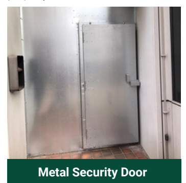
Our security doors are made in our London facility, giving us the flexibility to sell or rent them. This setup allows for customisation, including colour and branding, to meet specific needs.