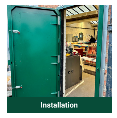
We provide a nationwide installation service for our steel security doors in the UK, customised for your property's needs. Our service offers a secure solution at a competitive price, ensuring peace of mind.

The Door 1 model is an affordable, entry-level steel security door designed for strength and durability. It supports a security padlock, providing a cost-effective solution against unauthorised access. This model reflects our dedication to making property protection both easy and affordable.